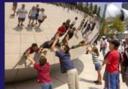
Anish Kapoor Cloud Gate, 2004 Millennium Park, Chicago, $23 million