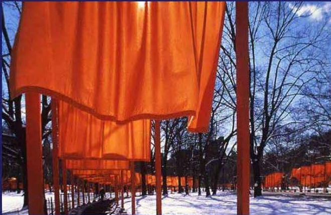
Christo and Jeanne Claude The Gates, Central Park, New York, 1979-2005 Budget: $21 million

Temporary or permanent elements of a public space designed by an artist or artist team for the enjoyment and inspiration of diverse stakeholders.