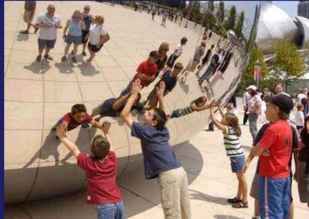
Anish Kapoor Cloud Gate, 2004 Millennium Park, Chicago, $23 million