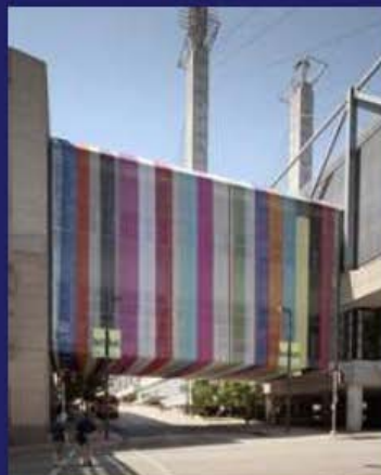
Rachel Hayes, Skywalk , 2003