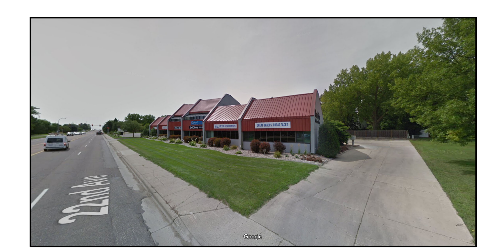
4 NEARBY BUILDINGS - A