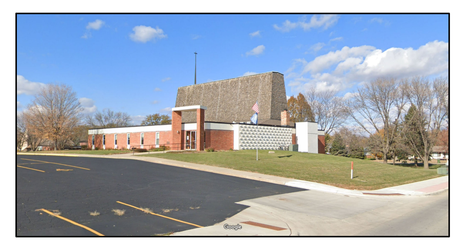
5 NEARBY BUILDINGS - B