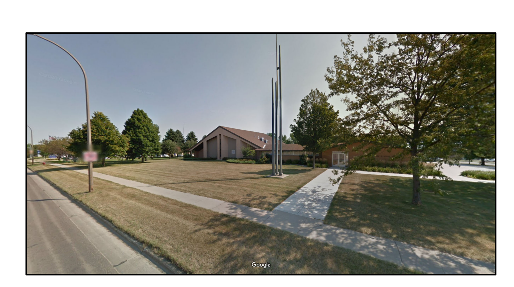
7 NEARBY BUILDINGS - D