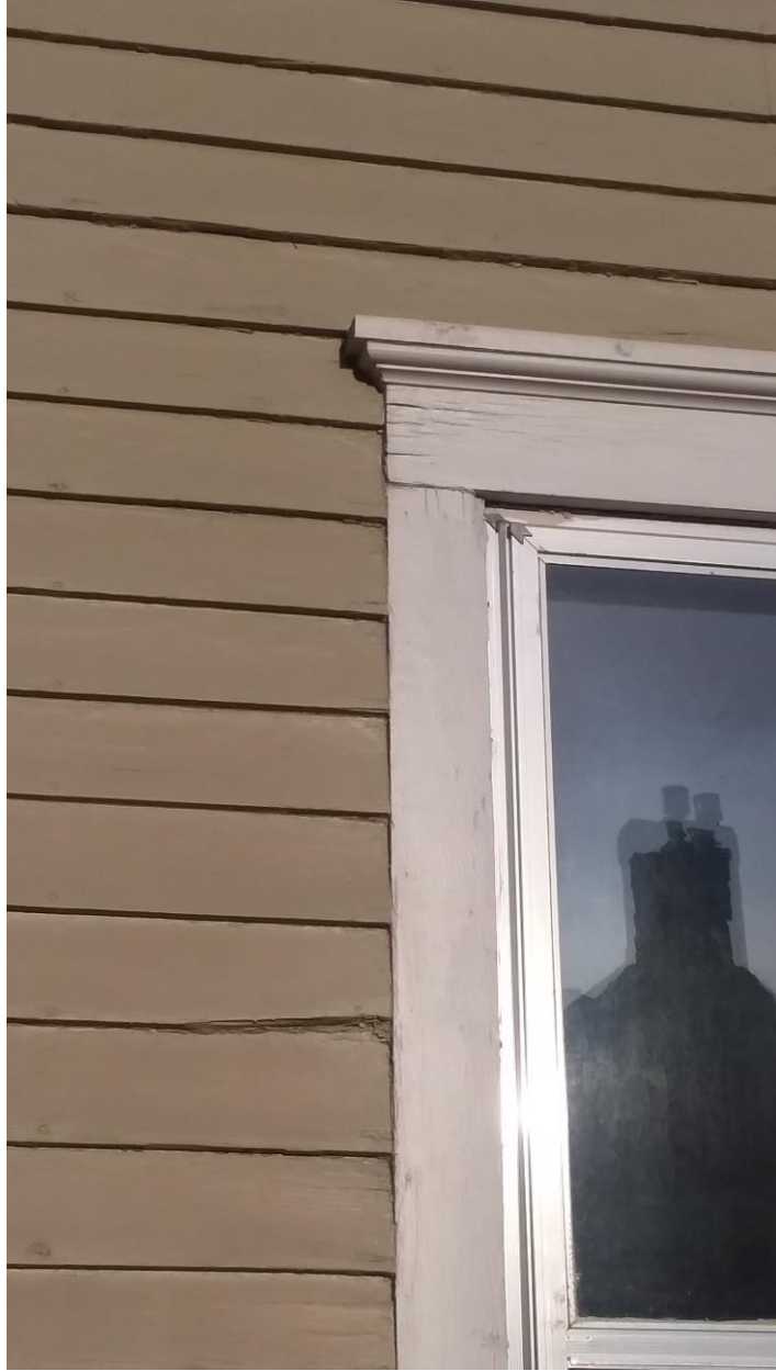
Example of Siding/Trim Proposal