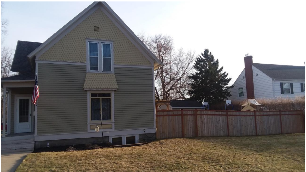
Existing Home – North Elevation