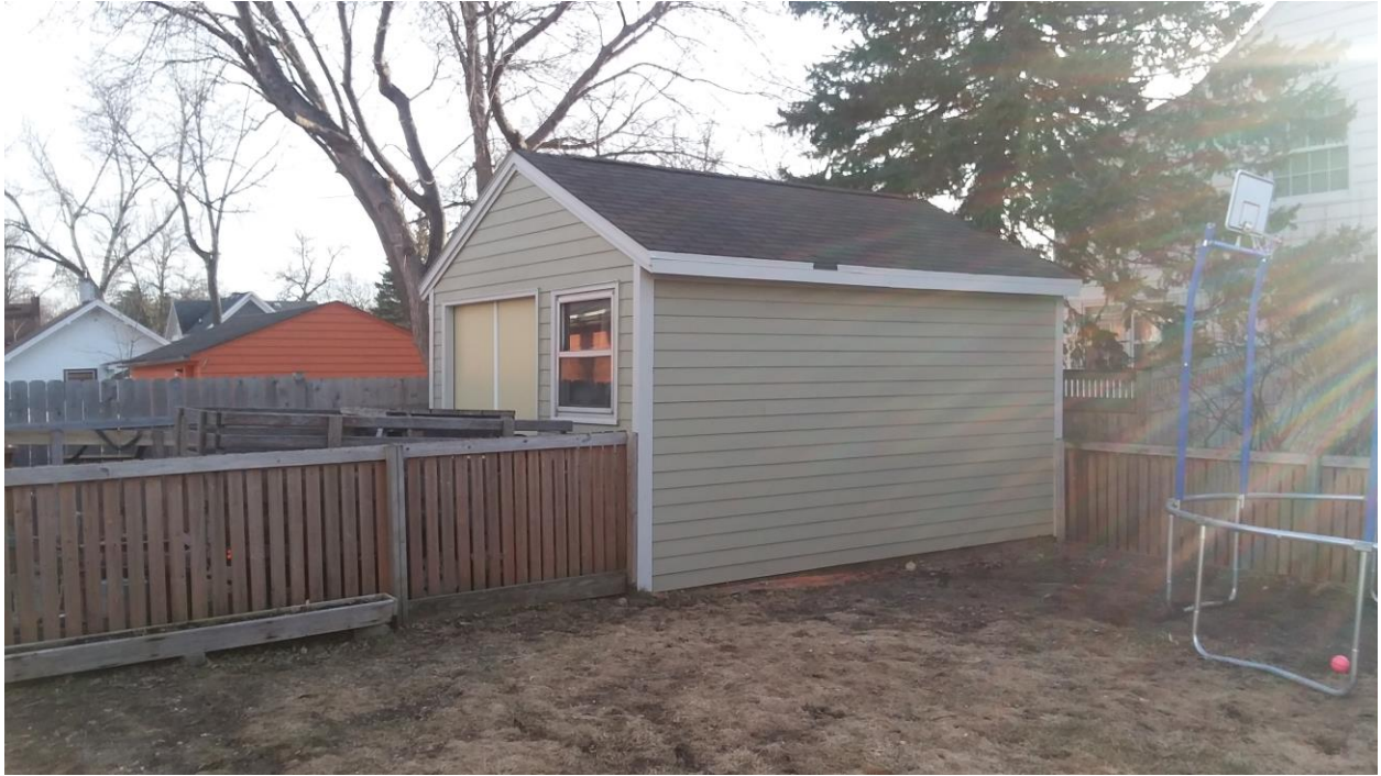
North Elevation – Current Shed