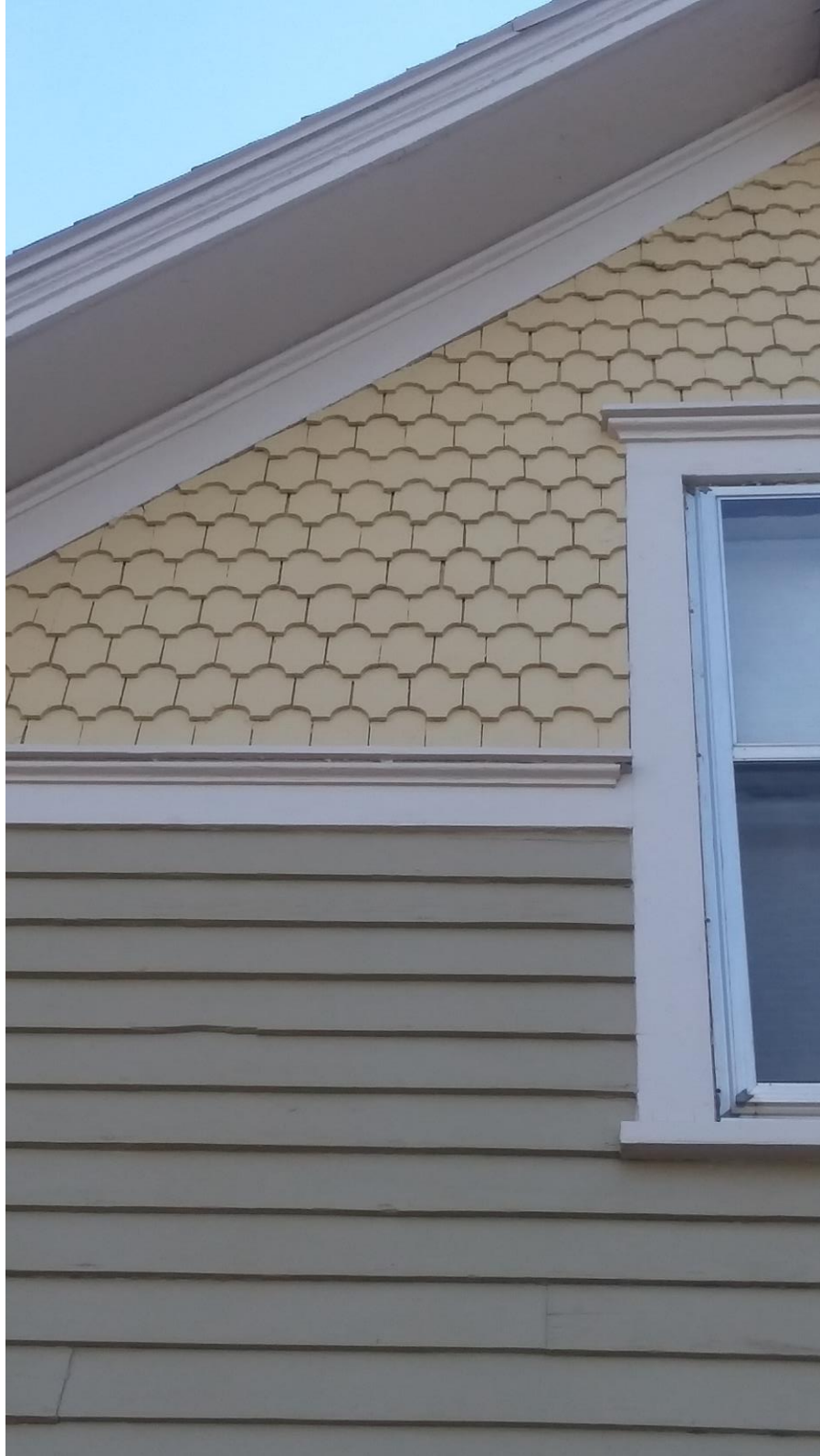
Example of Shakes