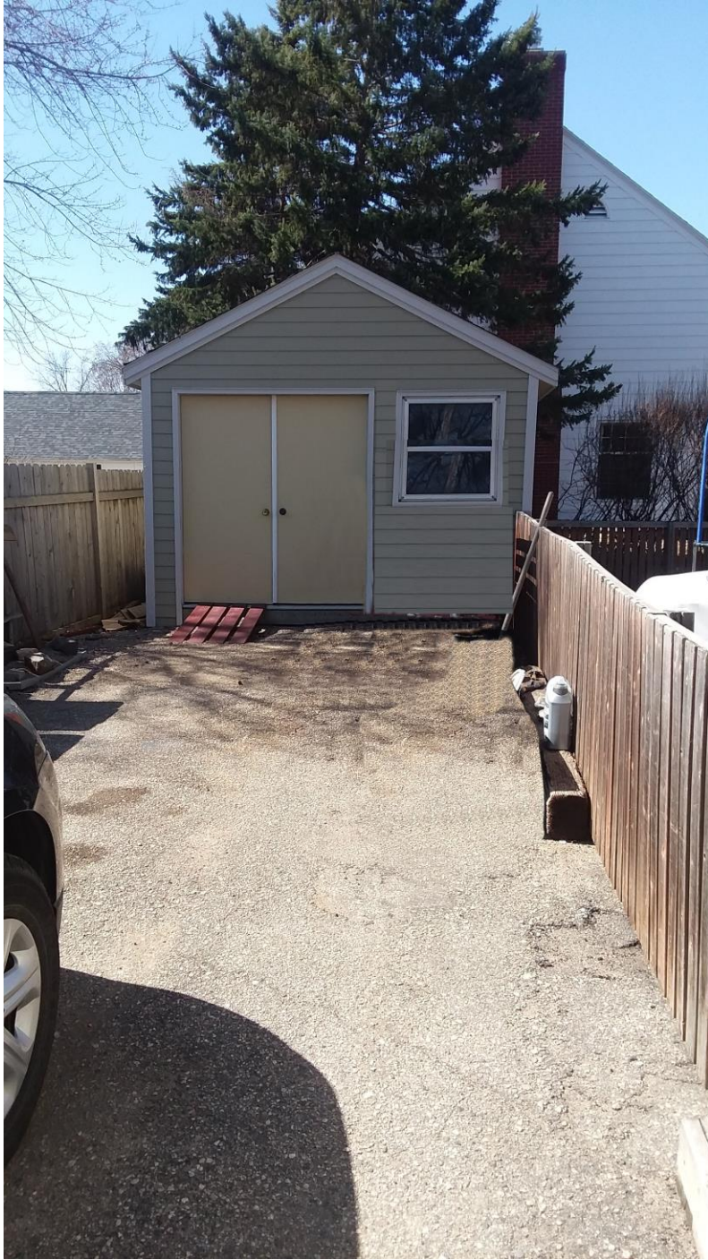
East Elevation of Current Shed