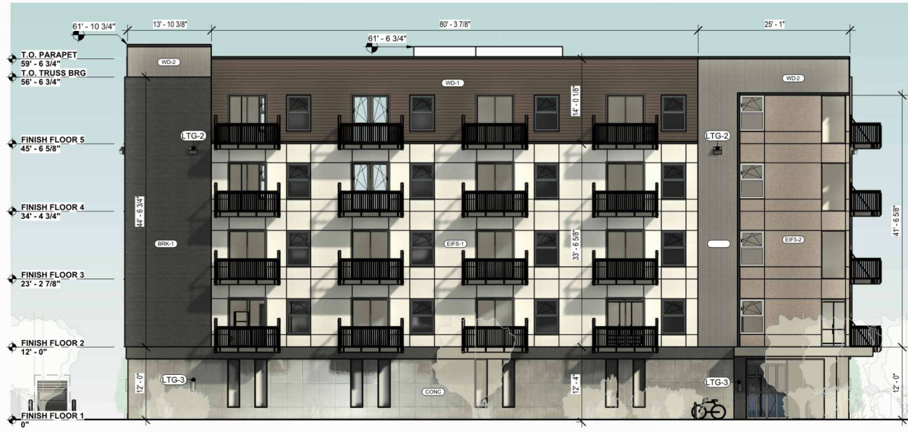
1 BUILDING ELEVATION - NORTH 1" = 10'-0"