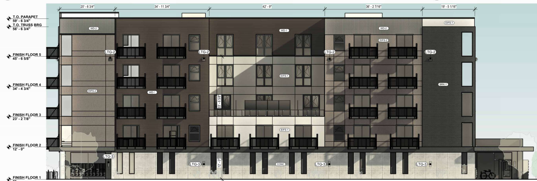
3 BUILDING ELEVATION - WEST 1" = 10'-0"