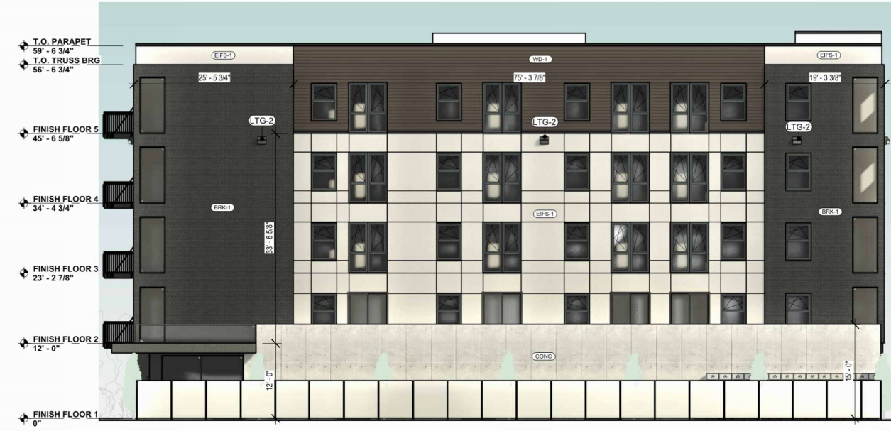
2 BUILDING ELEVATION - SOUTH 1" = 10'-0"