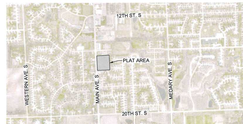
VICINITY MAP SCALE: NONE

*** THE SIDE YARD WILL BE REQUIRED TO BE INCREASED TO TEN FEET WHEN THE BUILDING IS THREE OR MORE STORIES IN HEIGHT.