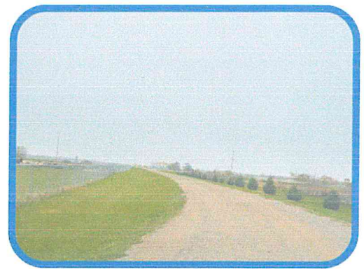
East and North Facing Our property is located down a very long driveway off of the Hwy 14 Bypass There is a center turning lane making entrance easy