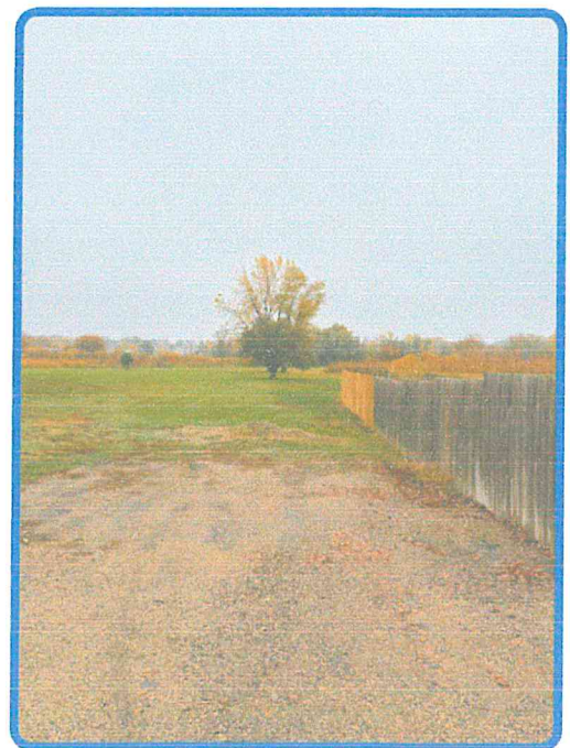
South facing is six mile creek, a pasture, Sexaur Park and the dog park