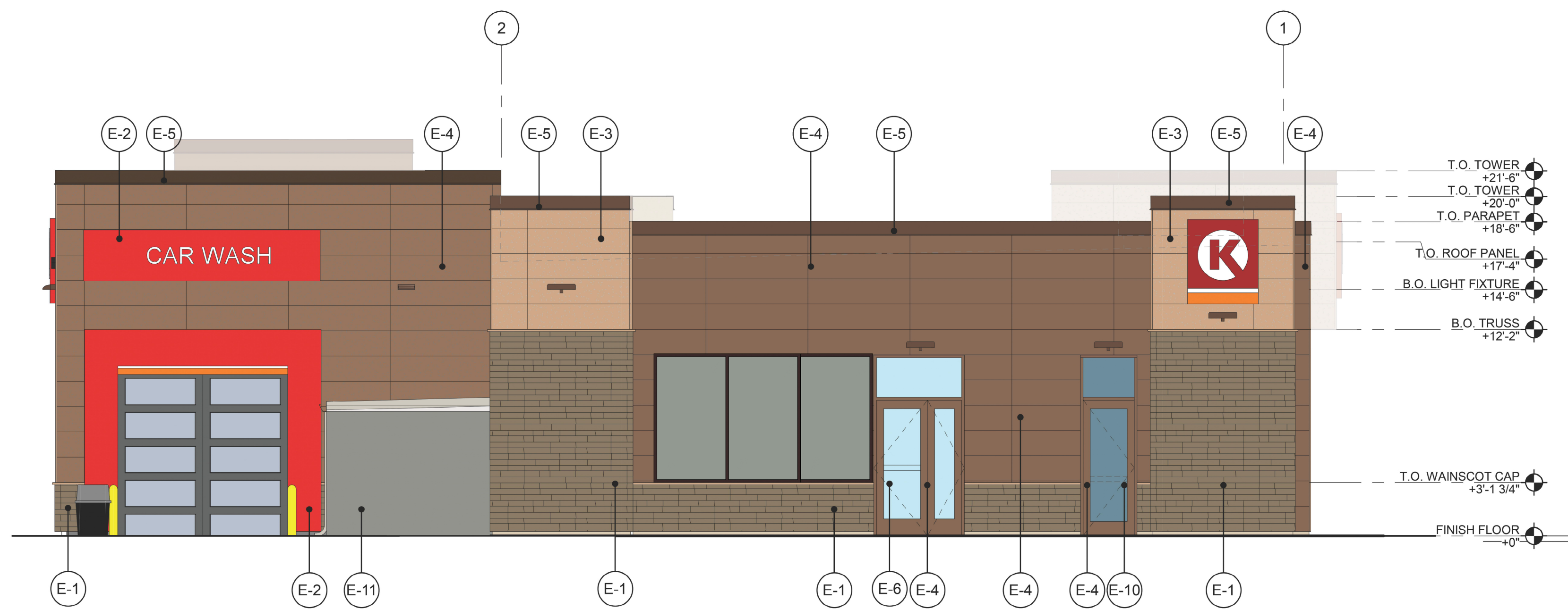
SIDE ELEVATION (EAST) | 2 3/16" = 1'-0"