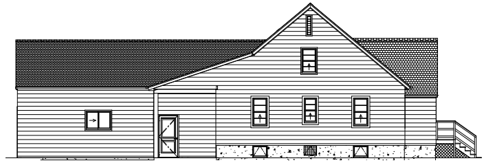
Exterior Elevation Left

4/12 PITCH PORCH/MUDROOM 6/12 PITCH REAR GABLE 10/12 PITCH RIGHT GABLE (TO MATCH EXISTING) 12" OVERHANGS EAVES 4" GABLE OVERHANDS 11FT WALL