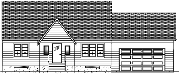
Exterior Elevation Front