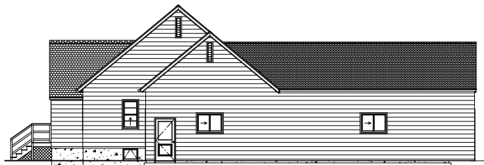
Exterior Elevation Right