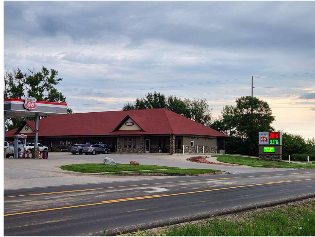
PHILLIPS 66 GAS STATION - WEST ON 20TH STREET SOUTH