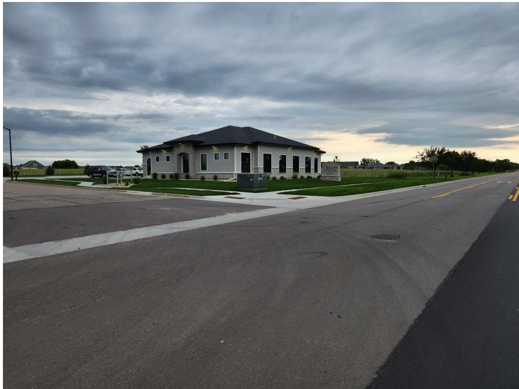
BISSON DENTAL - ACROSS CHRISTINE AVENUE

RWE PLANNING + DESIGN ARCHITECTURE PLANNING DESIGN 1303 OGDEN AVE., DOWNERS GROVE, IL 60515