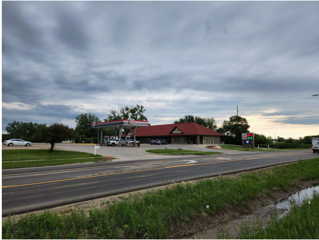
PHILLIPS 66 GAS STATION - WEST ON 20TH STREET SOUTH