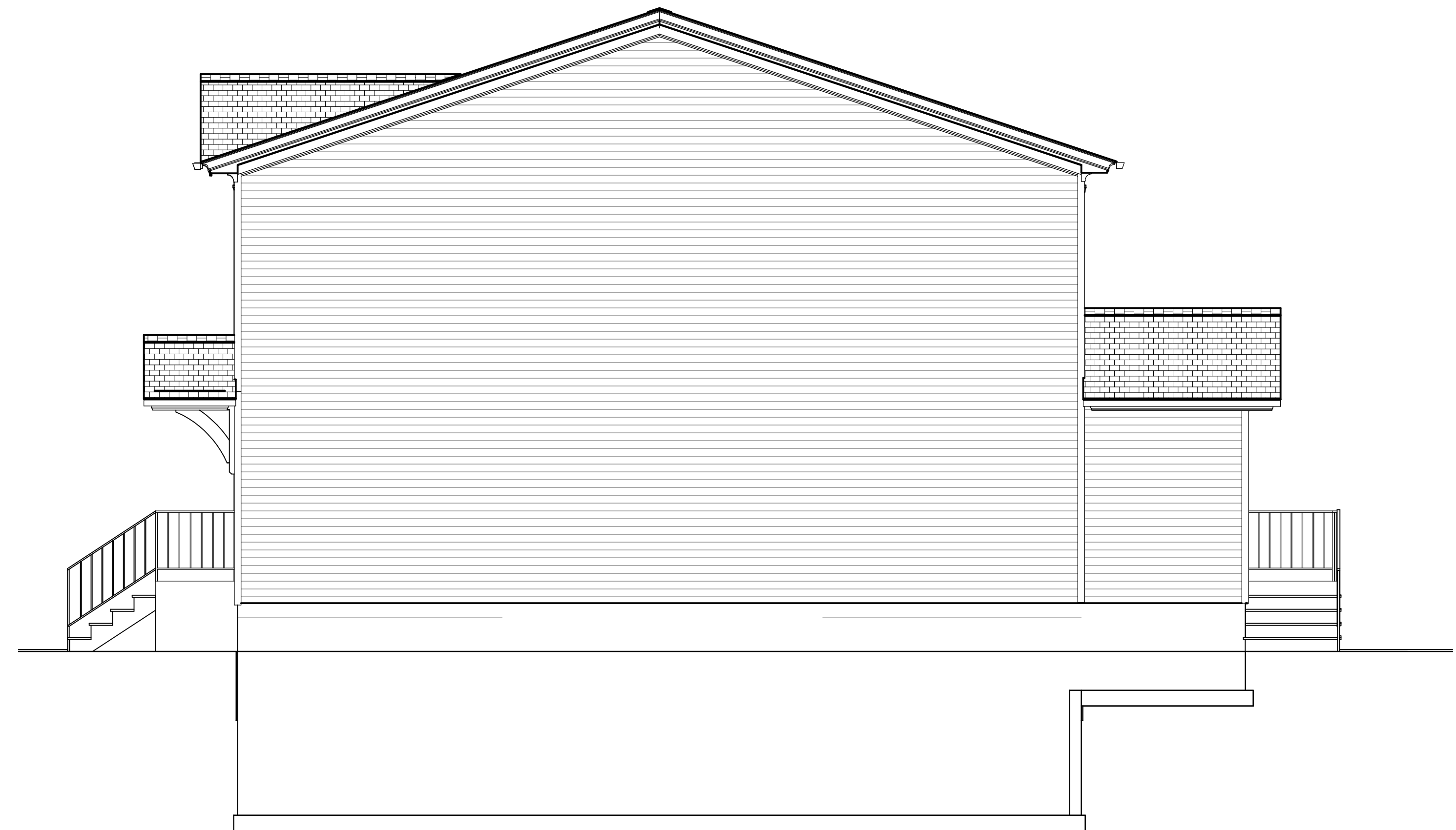
Exterior Elevation Right

4/12 PITCH 8/12 PITCH DECORATIVE GABLE 18" OVERHANGS 4' FRONT PORCH OVERHANG 8FT WALLS