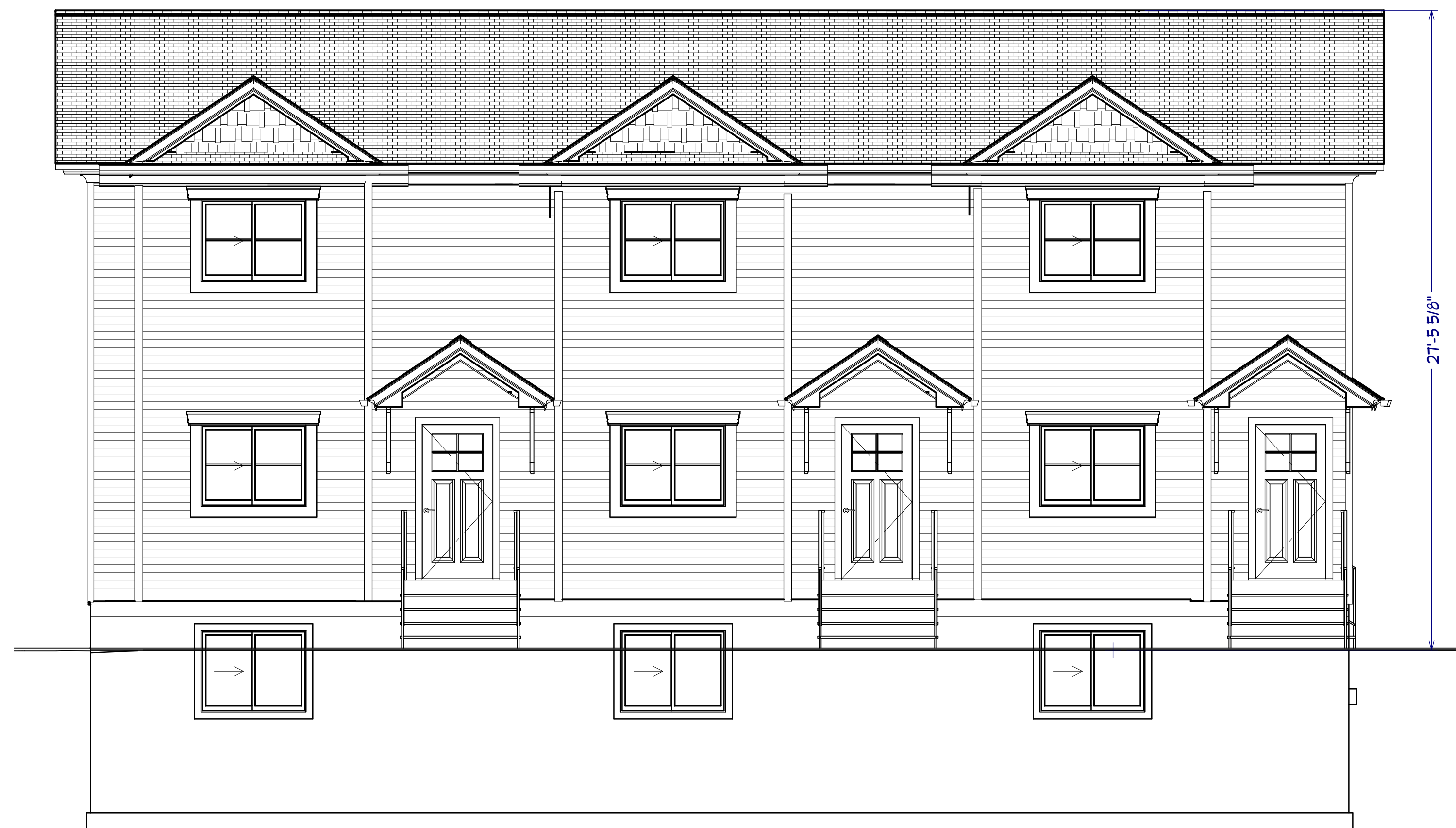
Exterior Elevation Front

4/12 PITCH 8/12 PITCH DECORATIVE GABLE 18" OVERHANGS 4' FRONT PORCH OVERHANG 8FT WALLS