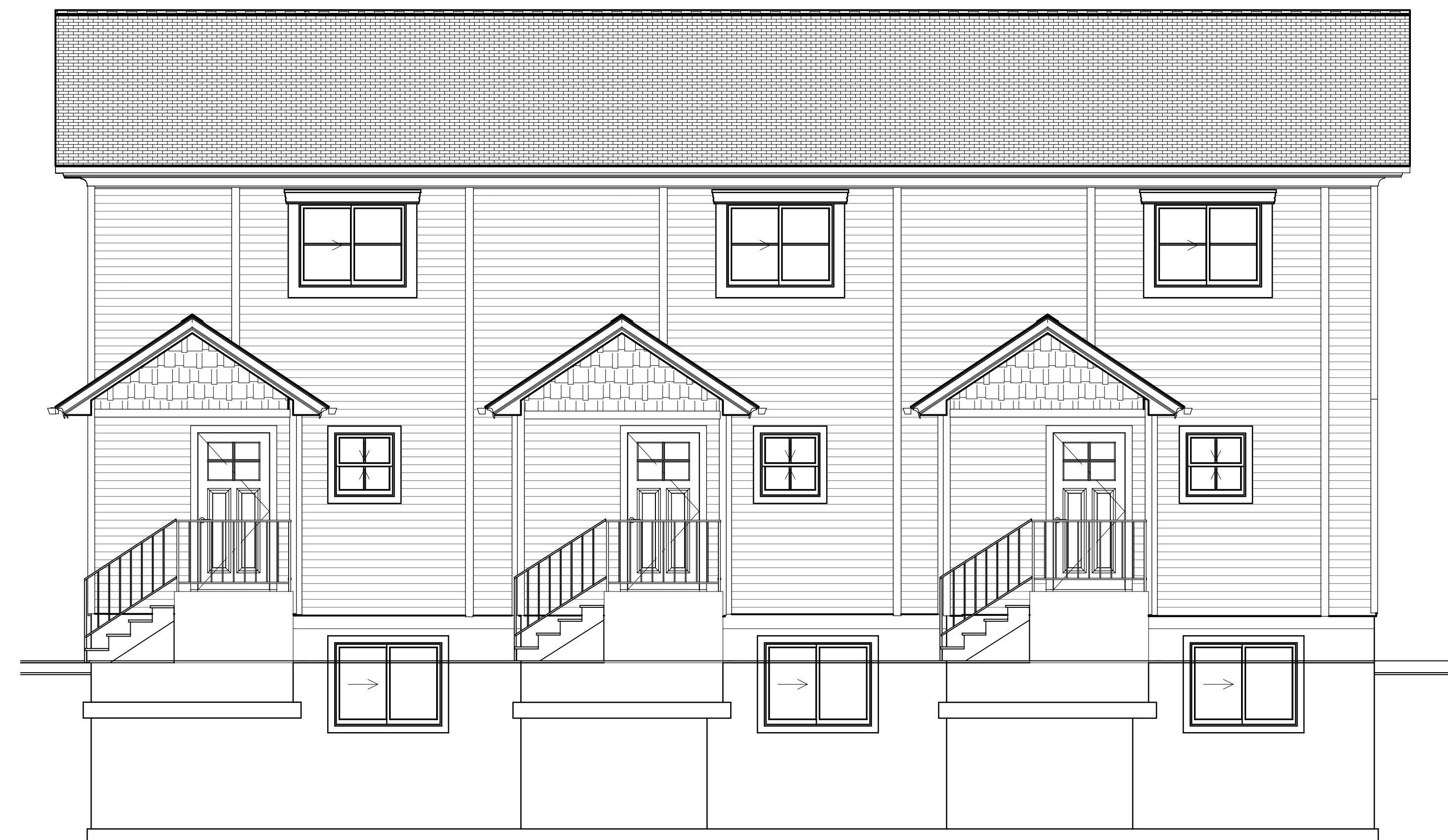
Exterior Elevation Back

4/12 PITCH 8/12 PITCH DECORATIVE GABLE 18" OVERHANGS 4' FRONT PORCH OVERHANG 8FT WALLS