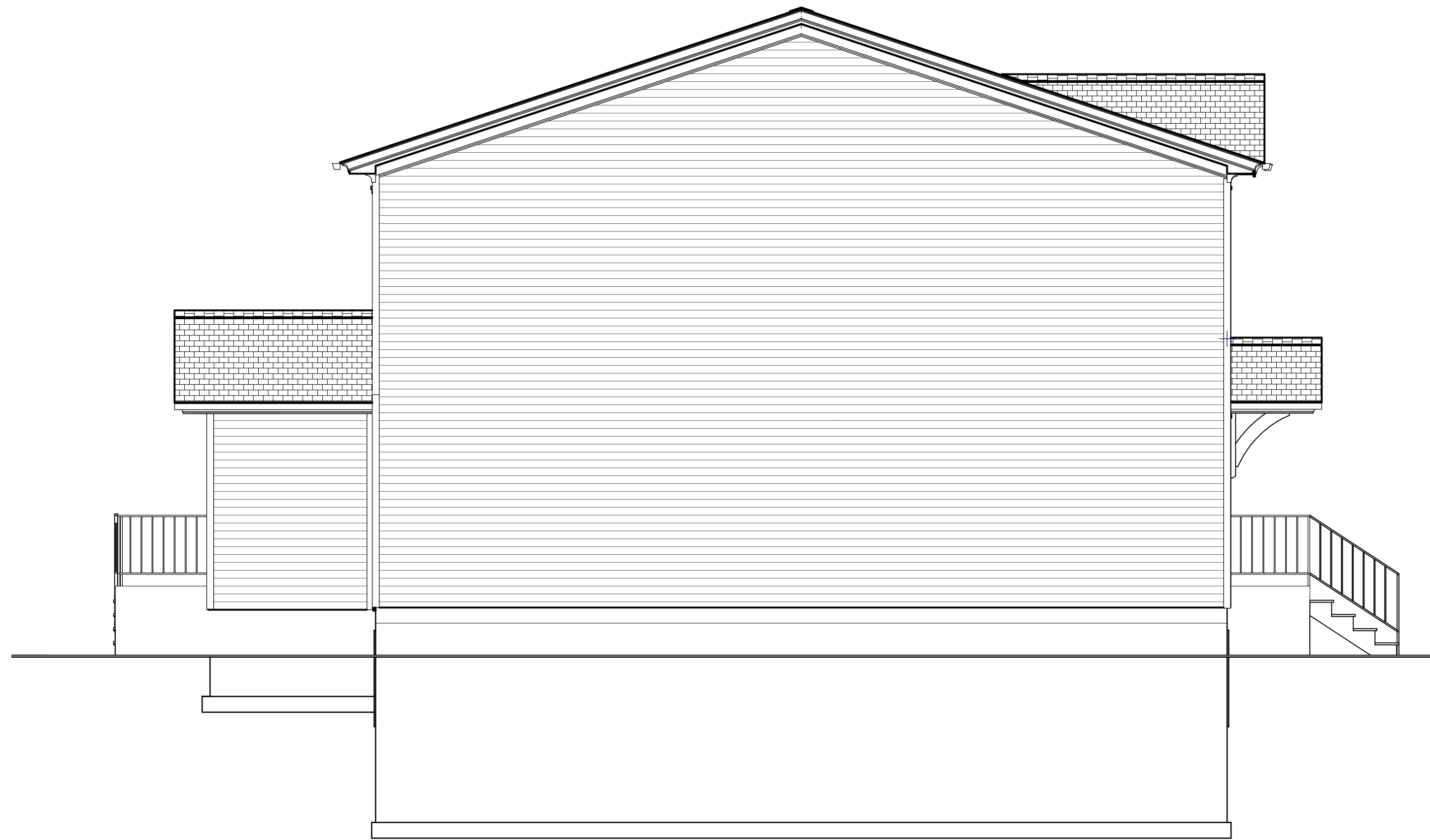
Exterior Elevation Left

4/12 PITCH 8/12 PITCH DECORATIVE GABLE 18" OVERHANGS 4' FRONT PORCH OVERHANG 8FT WALLS