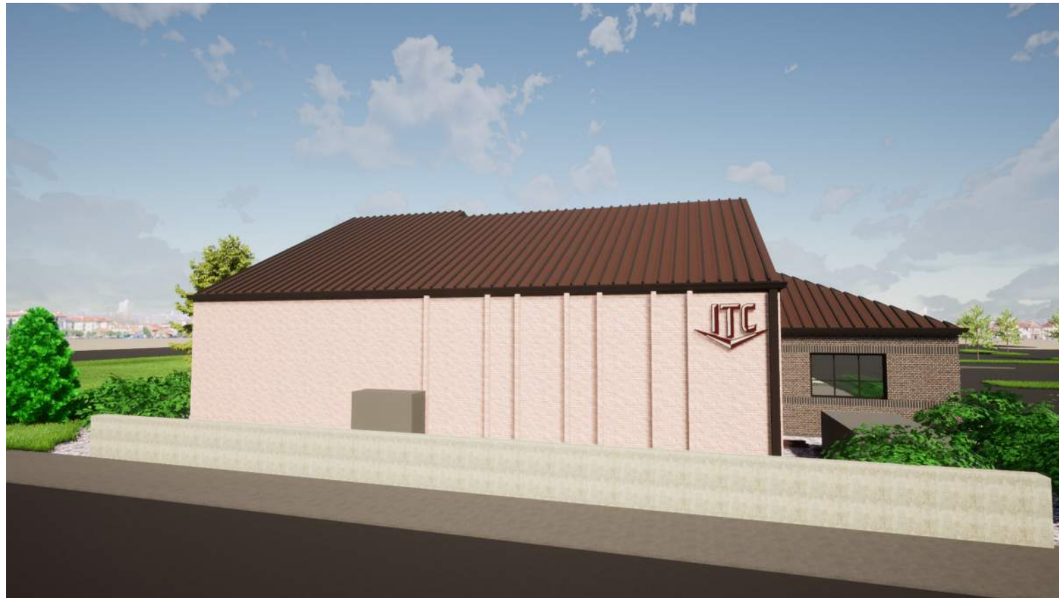
1 WEST ELEVATION A-102 NOT TO SCALE