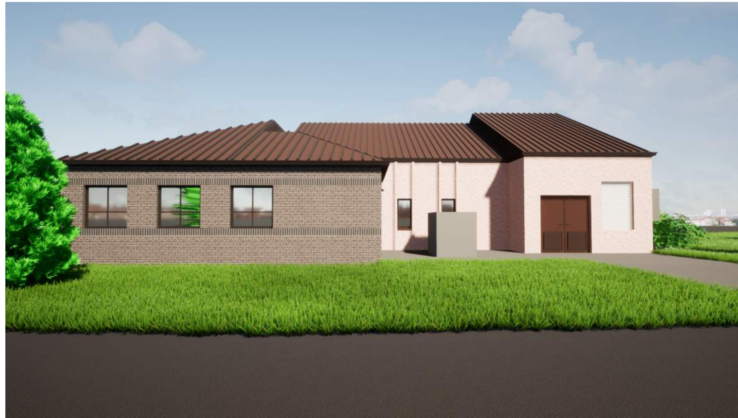
1 EAST ELEVATION A-101 NOT TO SCALE