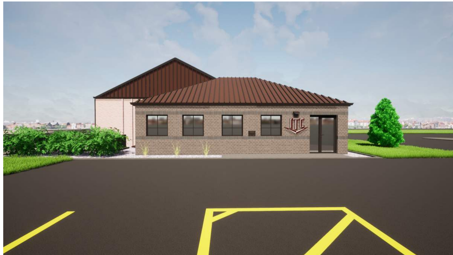
2 SOUTH ELEVATION A-102 NOT TO SCALE