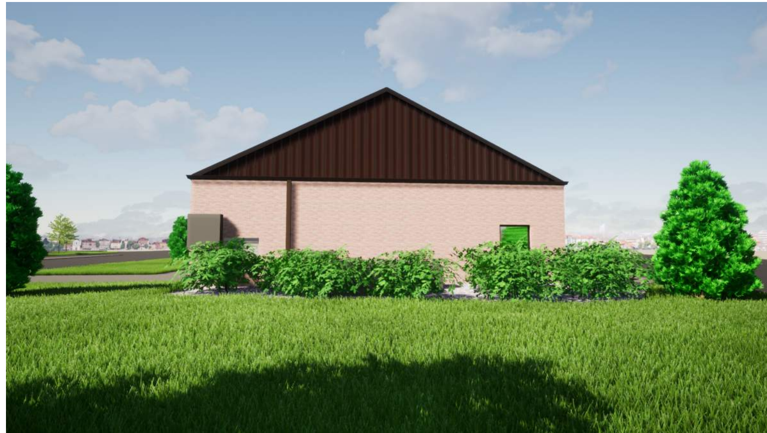
2 NORTH ELEVATION A-101 NOT TO SCALE