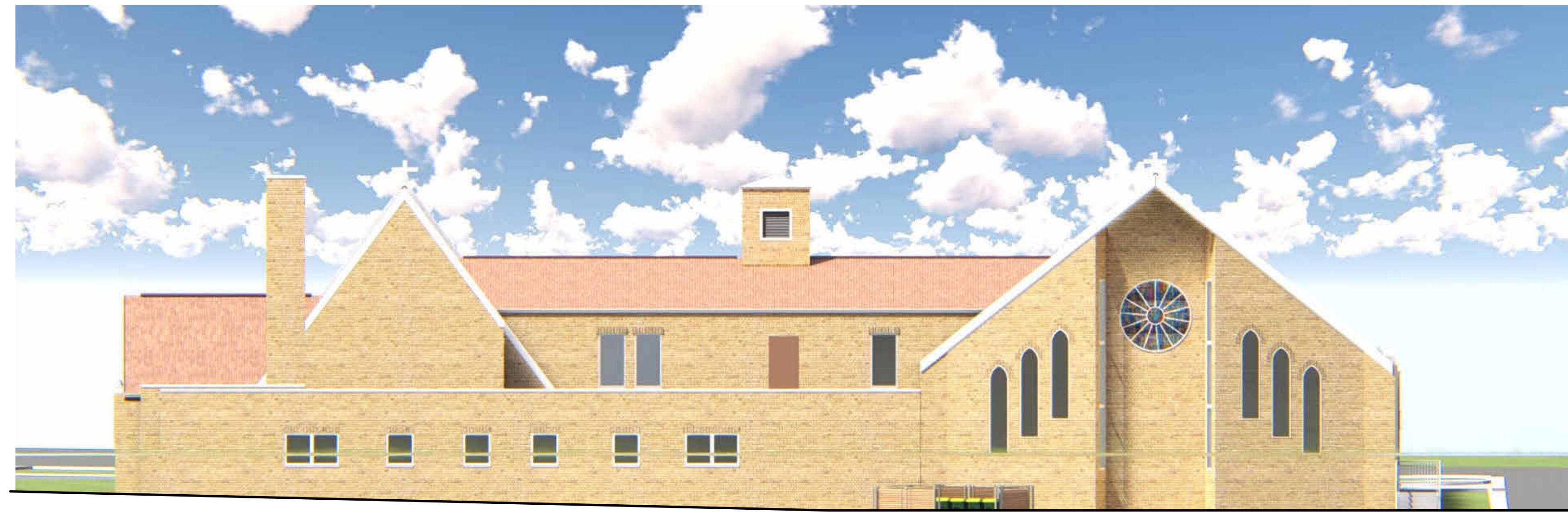
2 WEST ELEVATION