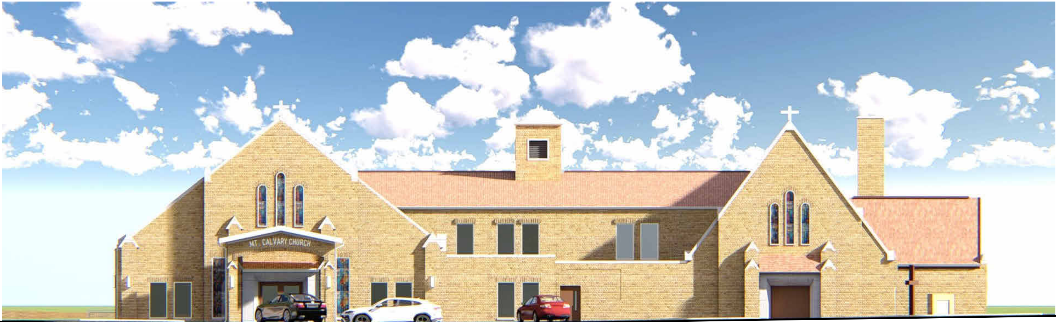
1 EAST ELEVATION