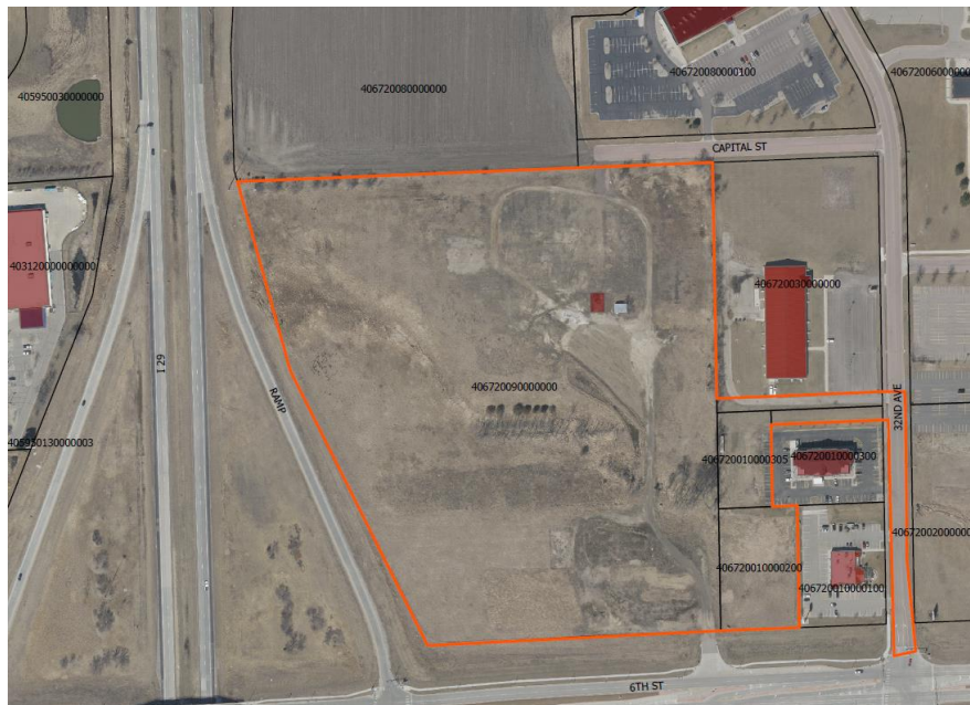
Figure 1. TID 13 Boundary

The area making up Tax Increment District #13 is shown on the Boundary Map in Figure 1.