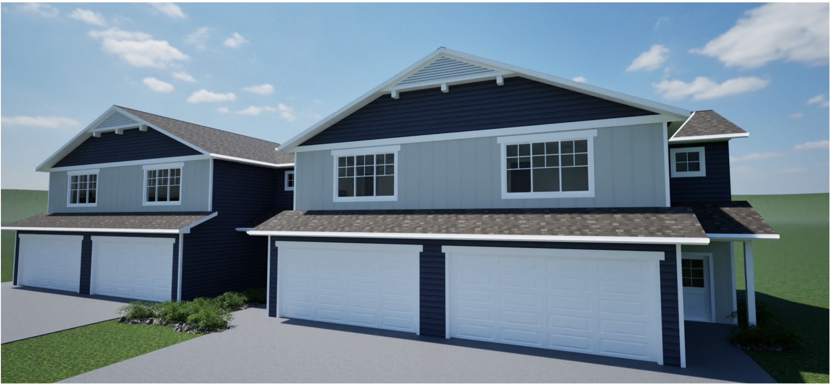
4 RIGHT UNIT FRONT C-4 RENDERING NOT TO SCALE