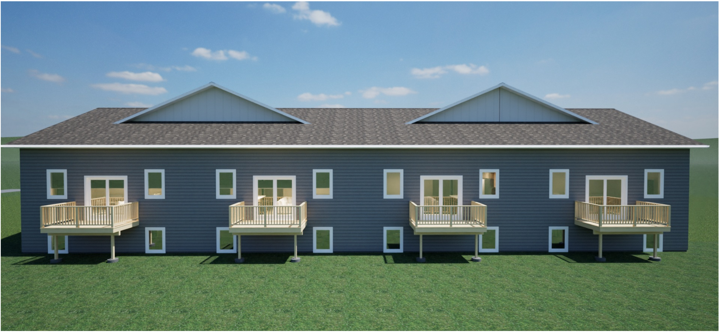
2 REAR ELEVATION C-4 RENDERING NOT TO SCALE