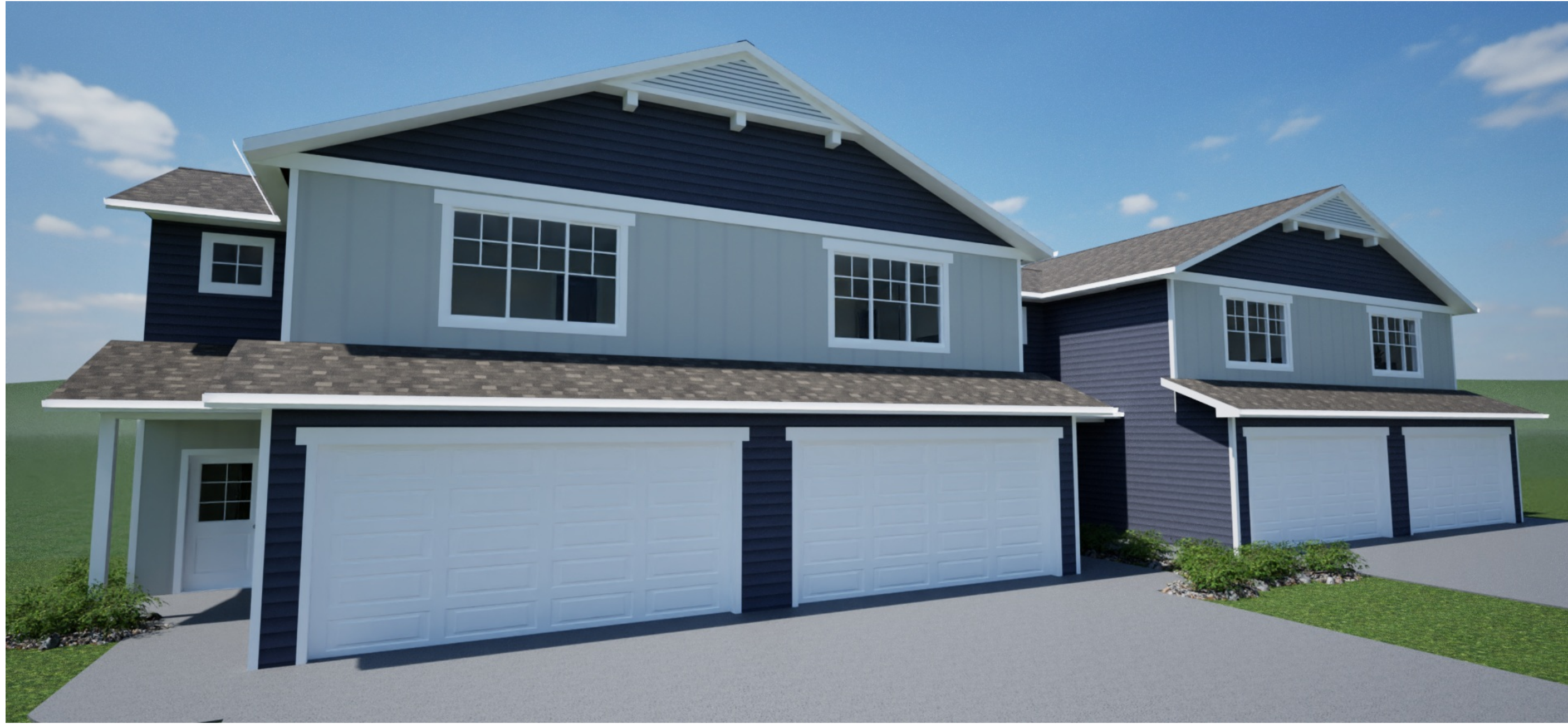
3 LEFT UNIT FRONT C-4 RENDERING NOT TO SCALE