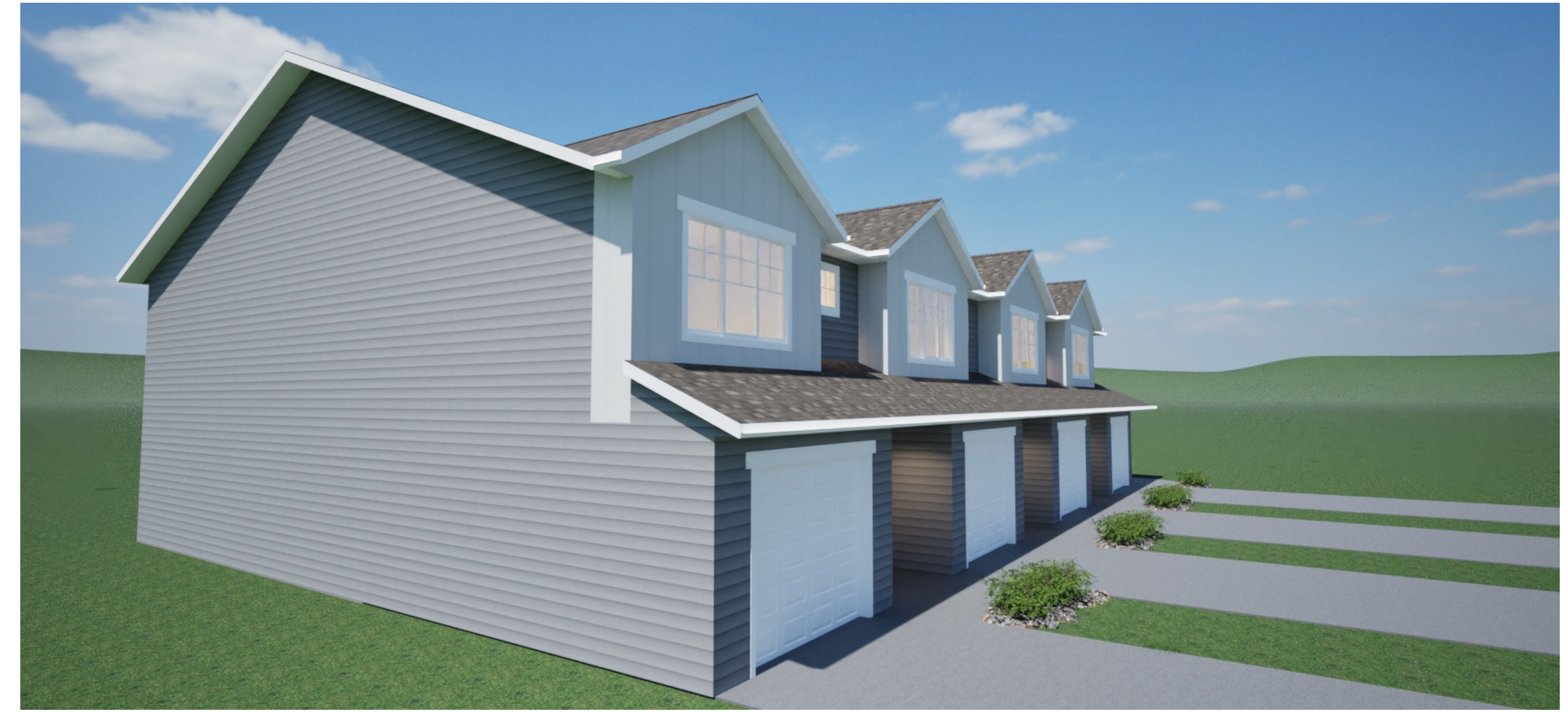
2 REAR ELEVATION C-3 RENDERING NOT TO SCALE