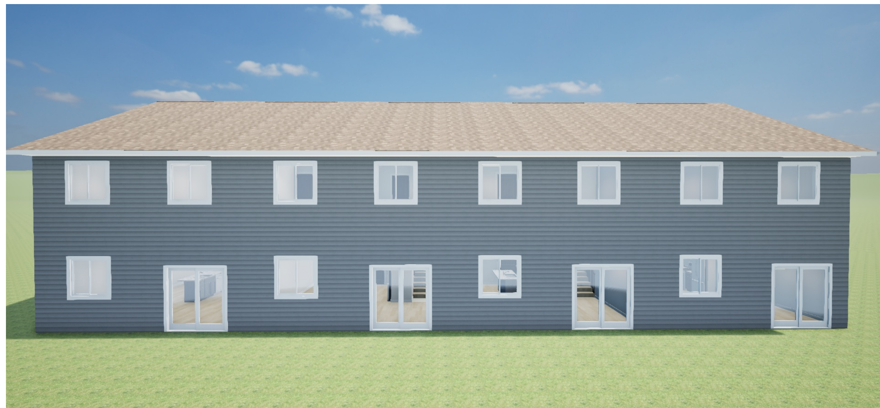
3 RIGHT UNIT FRONT C-3 RENDERING NOT TO SCALE