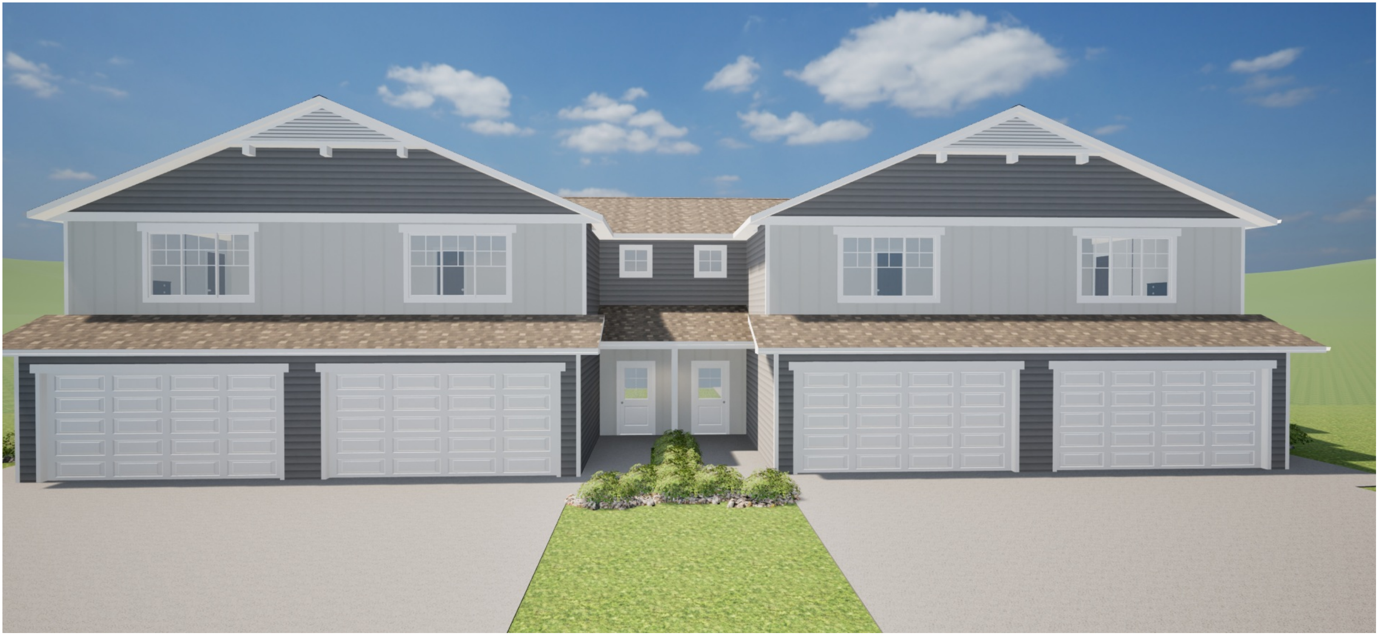
1 FRONT ELEVATION C-4 RENDERING NOT TO SCALE