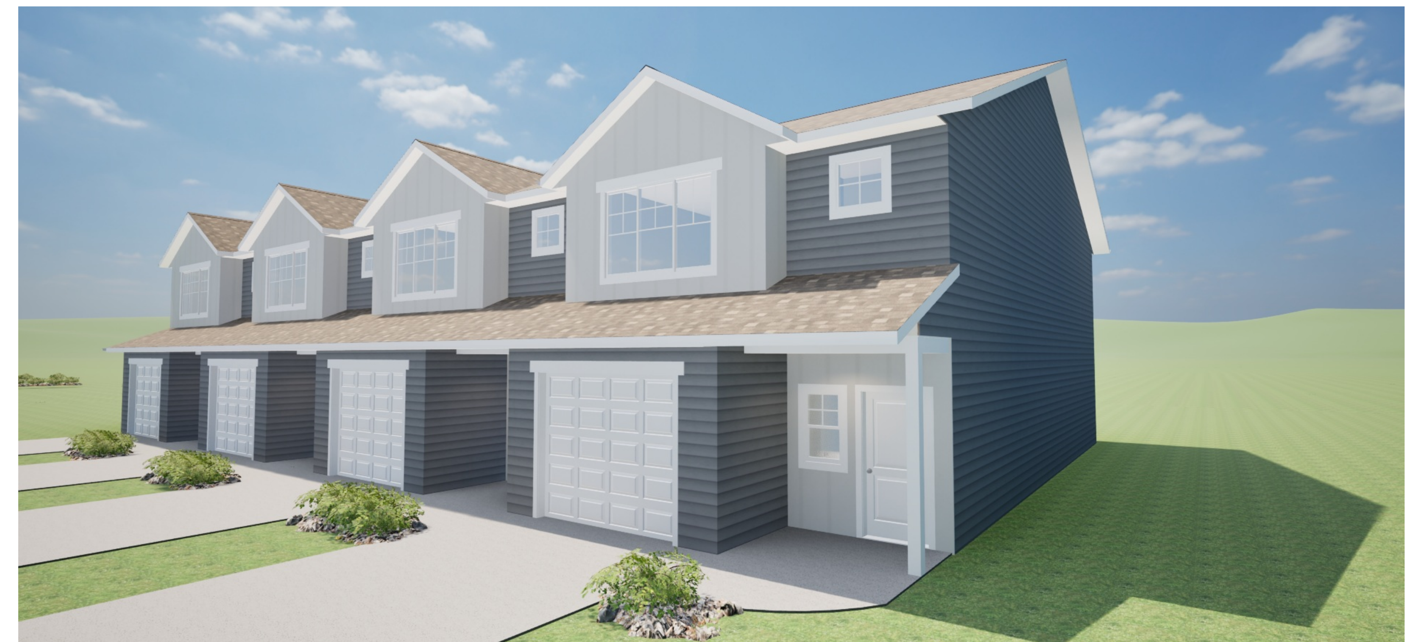
4 LEFT UNIT FRONT C-3 RENDERING NOT TO SCALE