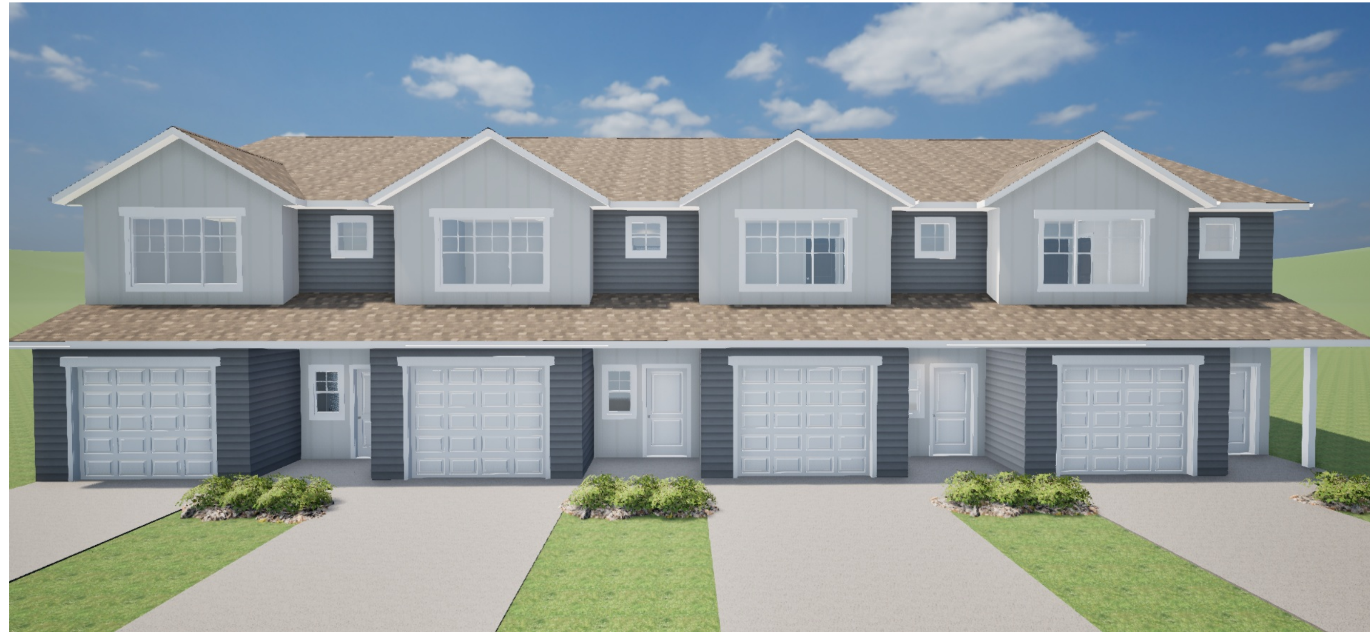
1 FRONT ELEVATION C-3 RENDERING NOT TO SCALE