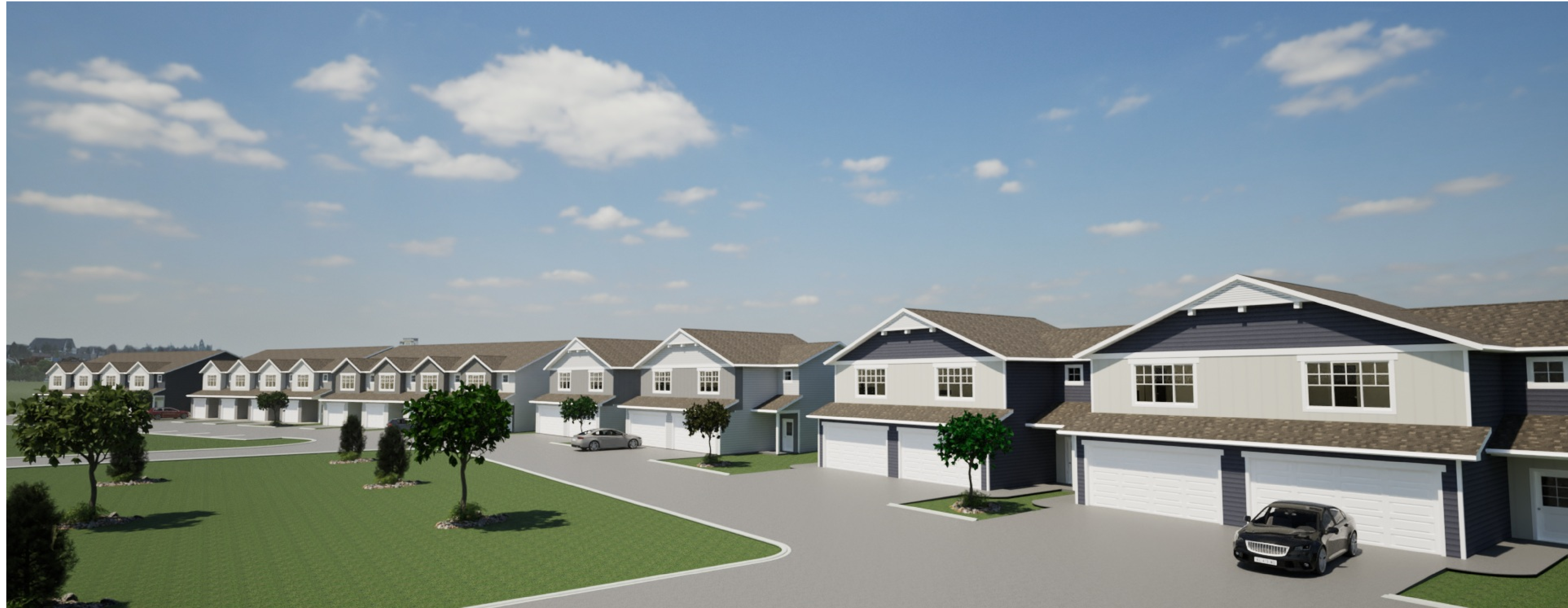
1 BUILDING SITE LAYOUT CONCEPT C-2 RENDERING NOT TO SCALE